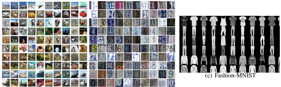
(a) CIFAR 10