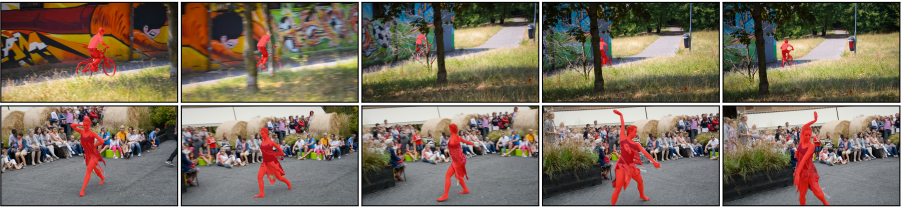
Figure 1: Additional Qualitative Results on DAVIS '16.