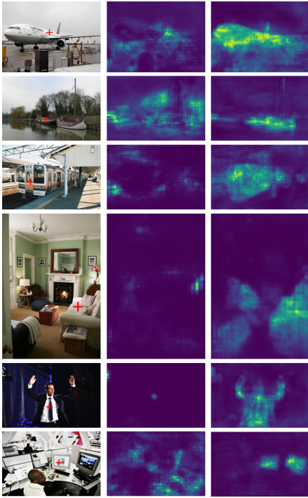
(a) similar foreground and background